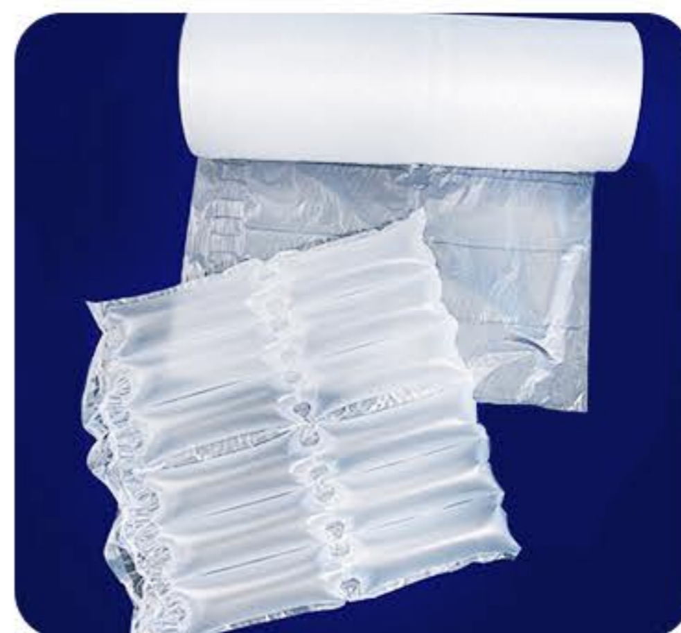
Air Column 3/5 row